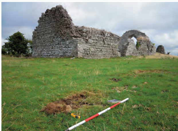
Evidence of ground disturbance as a result of unauthorised metal detecting near Rindoon, Co. Roscommon.