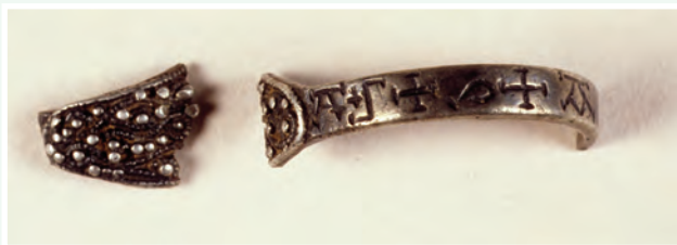
Inscribed medieval finger ring.

Before consent to use a metal detector is issued, the applicant will have to make clear that the use of the device is in accordance with best archaeological practice. This is achieved through the submission of a detailed method statement setting out the proposed work programme for assessing a site and achieving the greatest possible level of archaeological knowledge from the work undertaken.