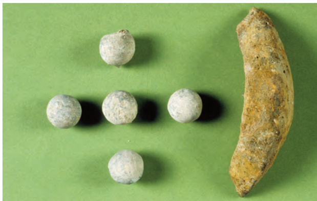
Musket balls and part of a fragmented mortar bomb from a 17th century battlefield.

The locations of recorded monuments are identified on the website of the National Monuments Service of the Department of Arts, Heritage and the Gaeltacht, www.archaeology.ie .