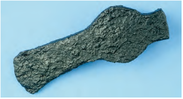
Medieval iron axe.