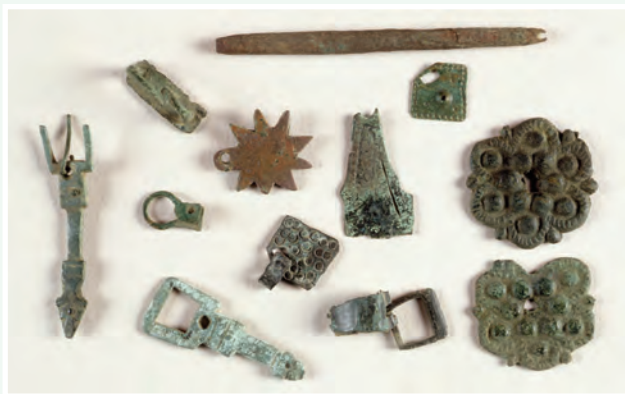
Medieval harness mounts, buckles and a harp-peg. Archaeological objects such as these are typical metal-detected finds.

Random searches with metal detectors cannot determine whether a find is of archaeological importance or if it is a recent discard. The result in either case is that the soil or setting is greatly disturbed and any non-metallic evidence and objects are likely to be destroyed.