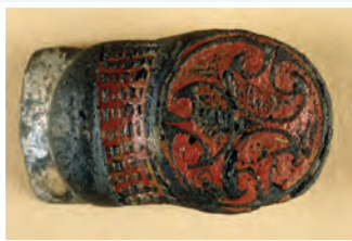
Enamelled terminal of an early medieval bracelet following conservation.

This document is intended only as a general guide to the provisions of the National Monuments Acts relating to metal detection devices and is not a legal interpretation of those Acts. The full text of the National Monuments Acts 1930-2004, and of other legislation that may be applicable, is available on www.irishstatutebook.ie .