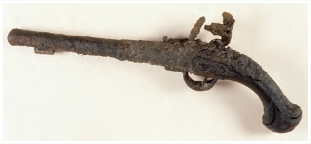
Officer's pistol 1700-1750. A find such as this may indicate the location of a battlefield.