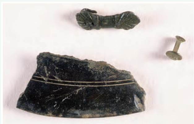
Medieval scallop-decorated belt mount, part of a vessel and a boat rivet of more recent vintage.

Anyone using a metal detector in contravention of the above restrictions and who, following detection of an archaeological object, digs to retrieve the object without an excavation licence may be guilty of an additional offence under the National Monuments Acts.